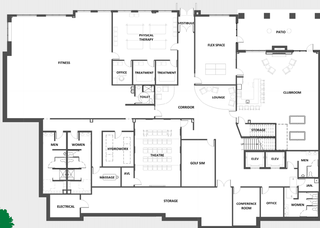
LOWER LEVEL PLAN